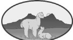
Fishwood Farm Alpacas

Two Seminars in one: Hands-on Alpaca Basics & Help! My Alpaca is Down!